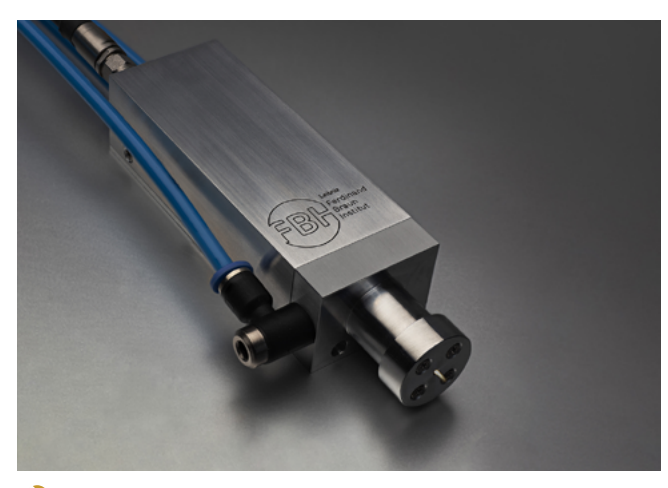
FBH's atmospheric microwave plasma source